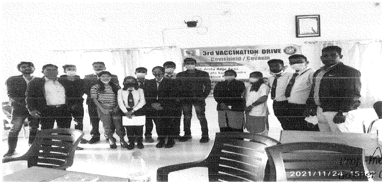
Programme Officers and volunteers of NSS Unit of Gossner College, Ranchi with the medical team from RIMS, Ranchi